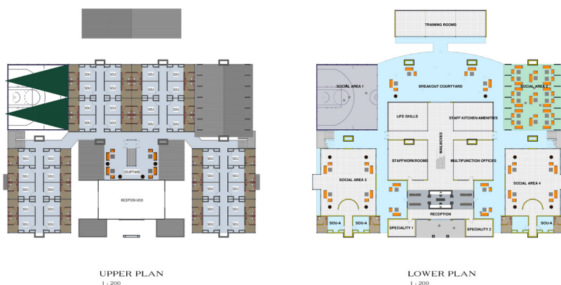
Concept floor plans for Wodonga EFYF

Residents must sign an agreement which covers all aspects of Youth Foyer life. The agreement upholds the rights and responsibilities of both the students and Foyer staff. Students must not only complete their studies, but also participate in a range of activities and opportunities offered to successfully complete the program.