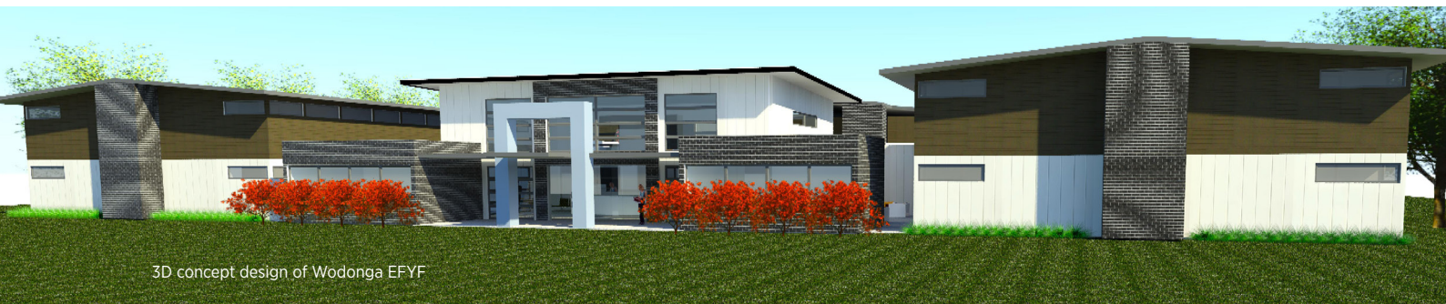
3D concept design of Wodonga EFYF

The Youth Foyer aims to break the cycle of youth homelessness and displacement, as well as disengagement from education, employment and the community by providing our most vulnerable youth with affordable accommodation on site, during the term of their studies. This will be coupled with 24/7 onsite support through Junction Support Services and education and career counselling provided during normal business hours by Wodonga TAFE Skills and Jobs Centre.